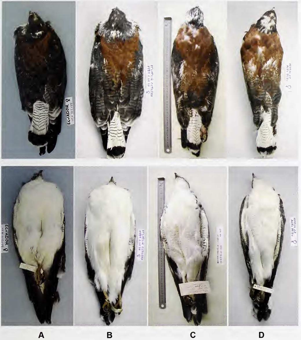
Figure 7. Pale-morph adult female Gurney's Hawks Buteo poecilochrous : (a and b) nominate subspecies from Ecuador; (c and d) subspecies fieldsai from Bolivia and Chile (BMNH)